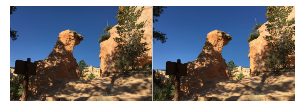
June 25, 2016: Bryce Canyon