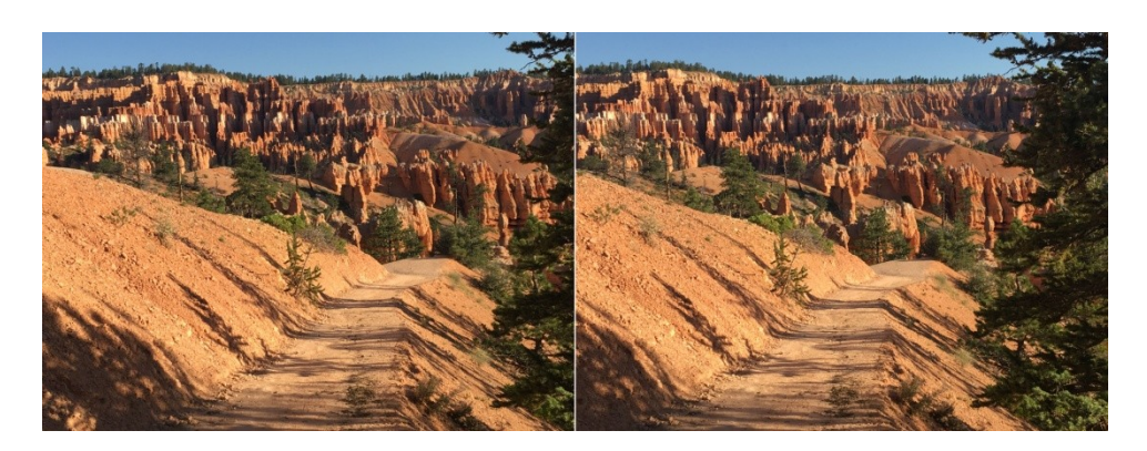
June 26, 2016: Bryce Canyon