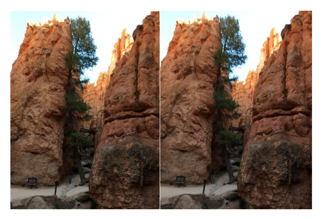
June 26, 2016: Bryce Canyon