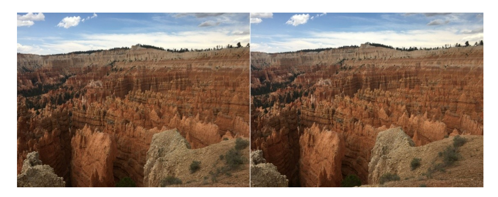
June 28, 2016: Bryce Canyon