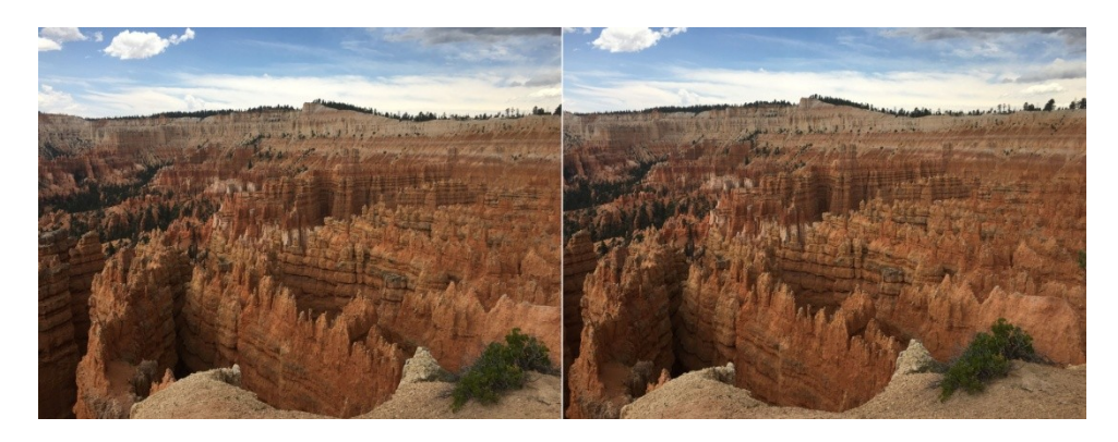
June 28, 2016: Bryce Canyon