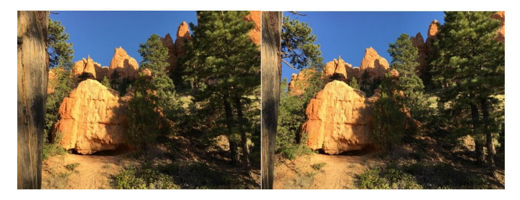
June 26, 2016: Bryce Canyon