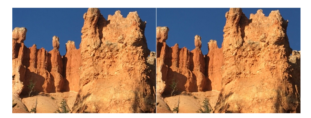
June 26, 2016: Bryce Canyon