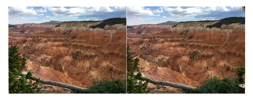
June 29, 2016: Cedar Breaks National Monument