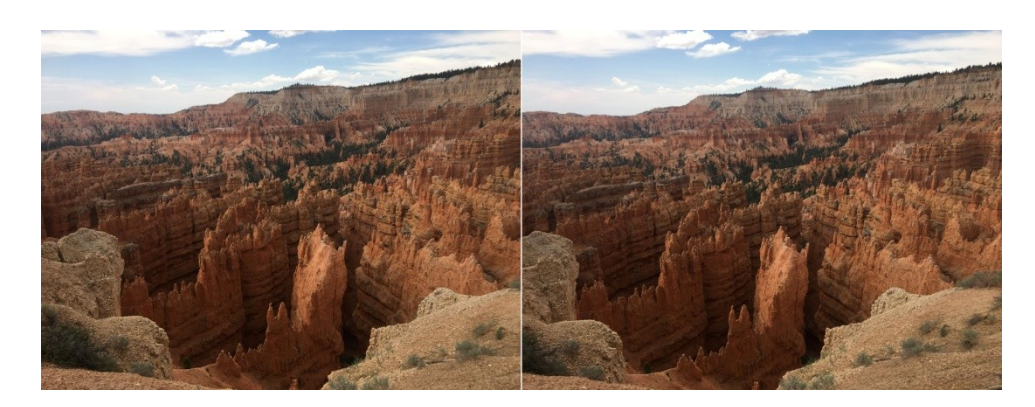
June 28, 2016: Bryce Canyon