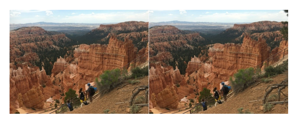
June 28, 2016: Bryce Canyon