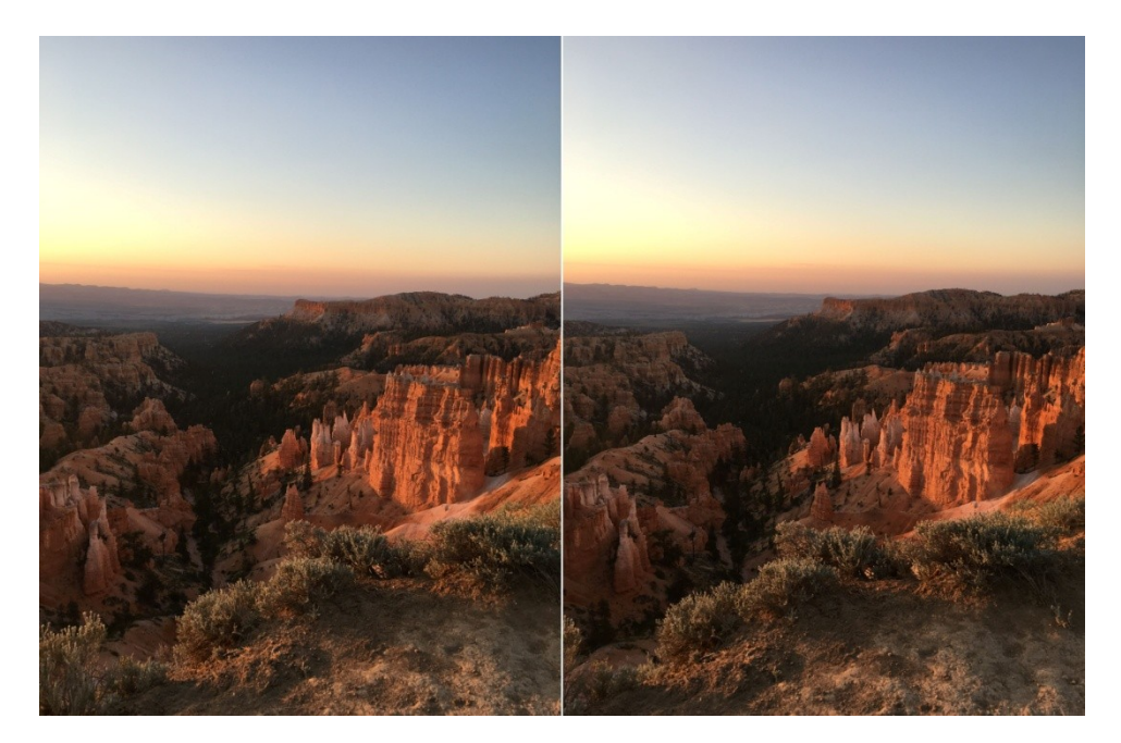
June 25, 2016: Bryce Canyon