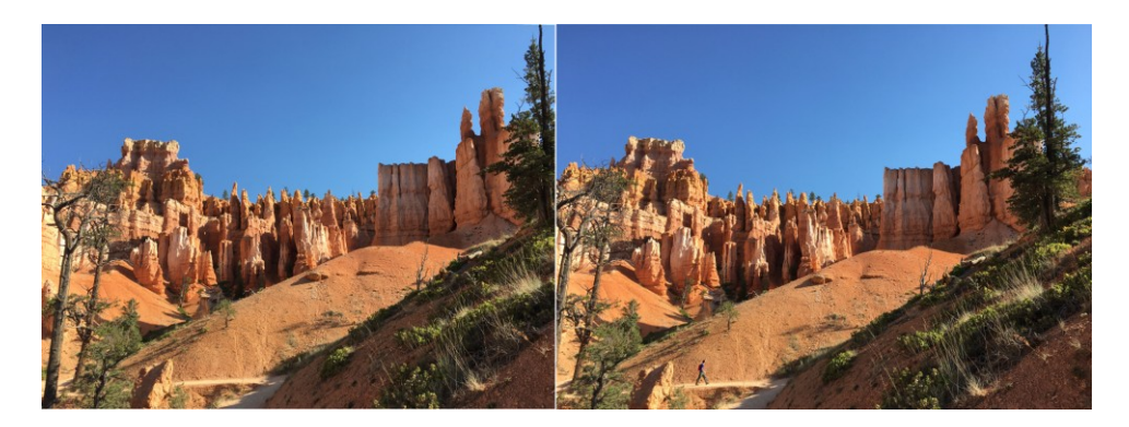
June 25, 2016: Bryce Canyon