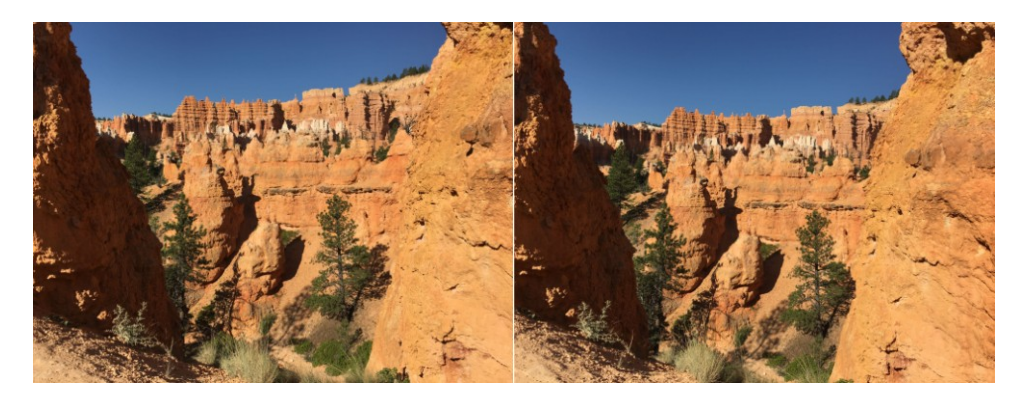
June 25, 2016: Bryce Canyon