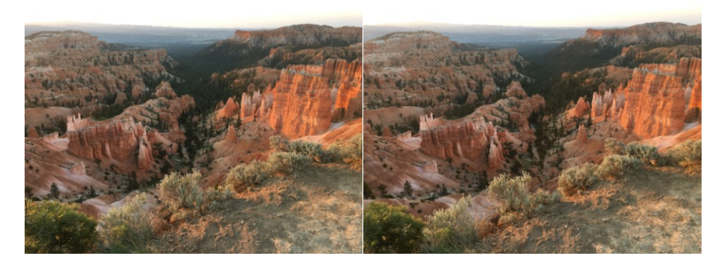
June 25, 2016: Bryce Canyon