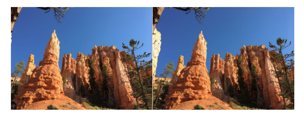
June 25, 2016: Bryce Canyon