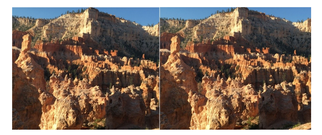
June 26, 2016: Bryce Canyon