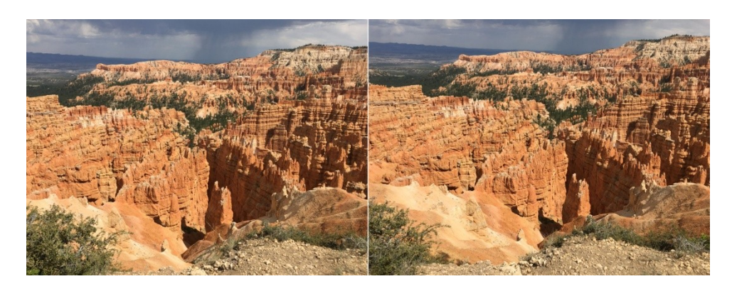
June 28, 2016: Bryce Canyon