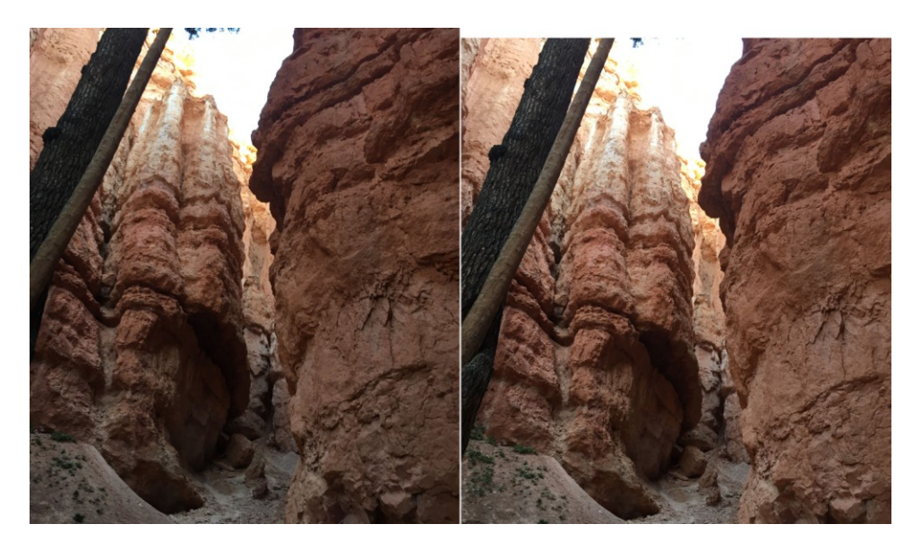
June 25, 2016: Bryce Canyon