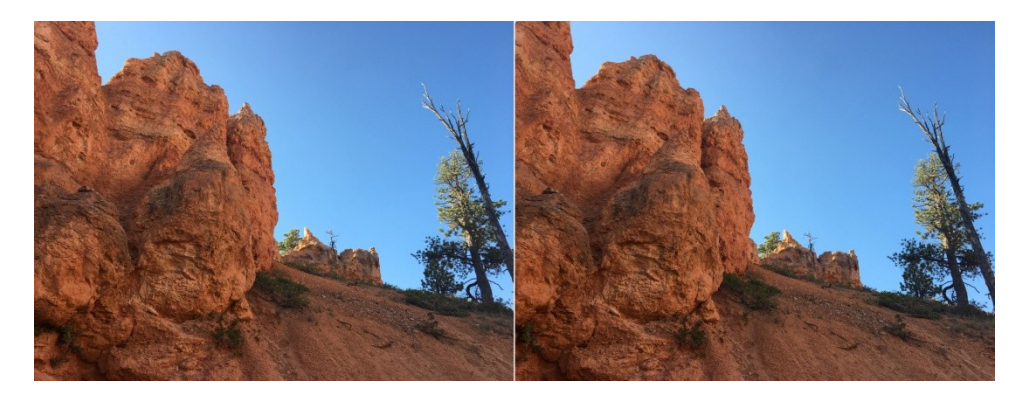
June 26, 2016: Bryce Canyon