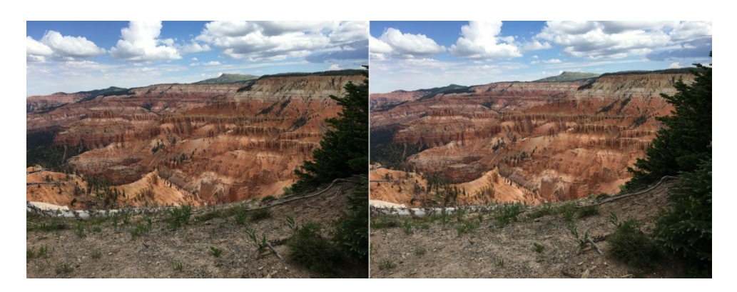
June 29, 2016: Cedar Breaks National Monument