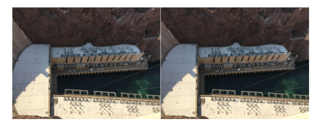
June 24, 2016: Base of Hoover Dam