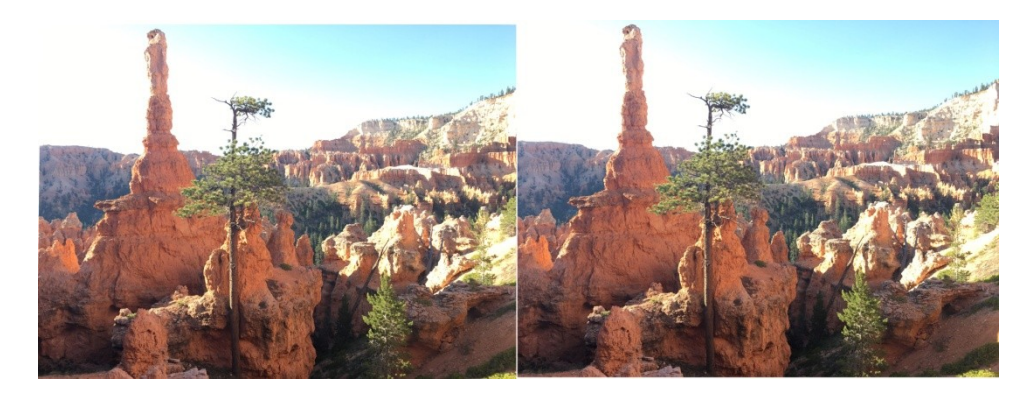
June 26, 2016: Bryce Canyon