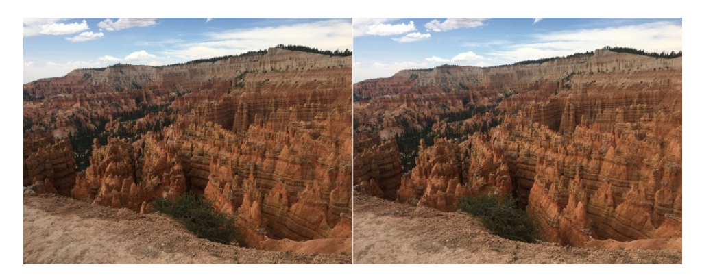
June 28, 2016: Bryce Canyon