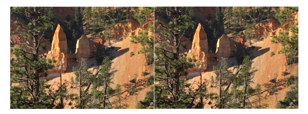
June 27, 2016: Bryce Canyon