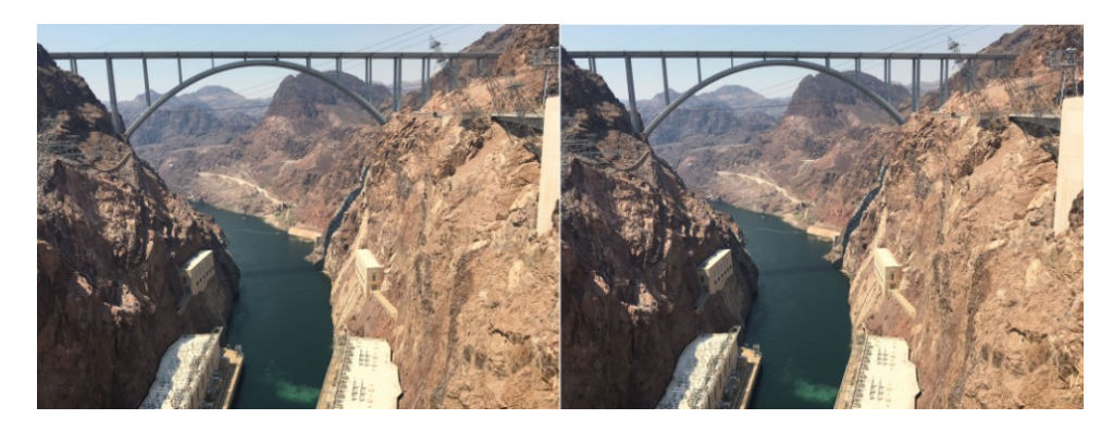
June 24, 2016: Hoover Dam Highway Bridge