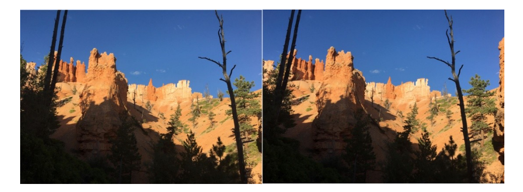
June 26, 2016: Bryce Canyon