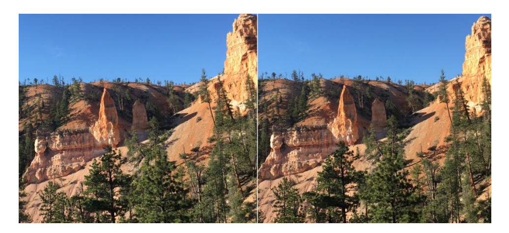
June 27, 2016: Bryce Canyon