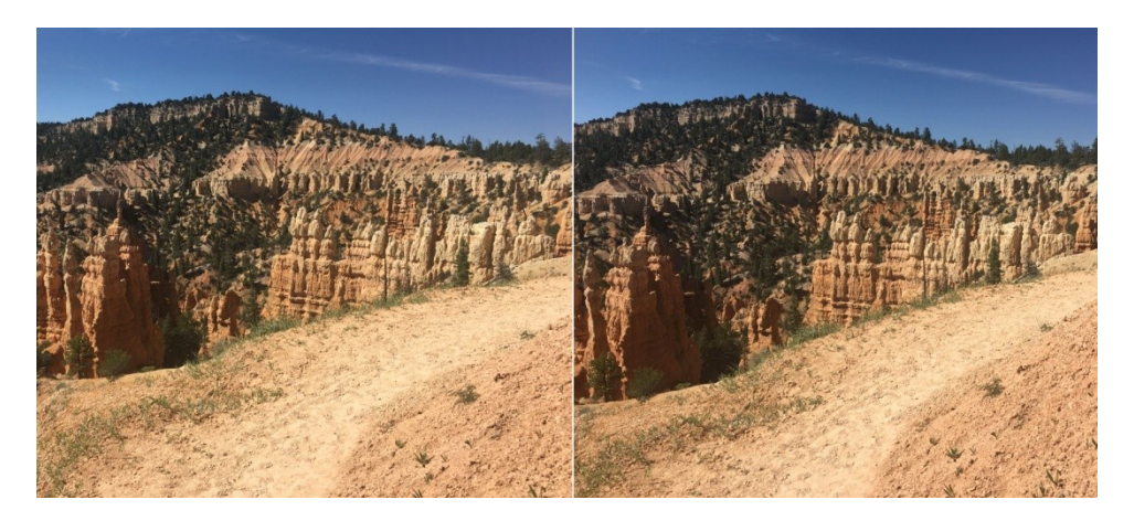
June 27, 2016: Bryce Canyon