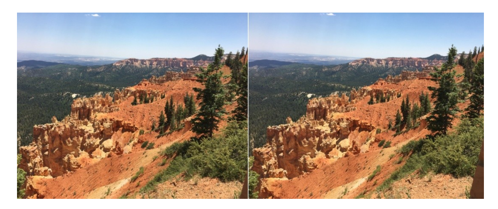
June 25, 2016: Bryce Canyon