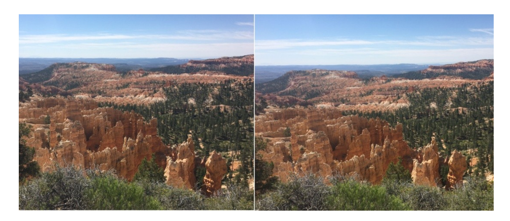
June 27, 2016: Bryce Canyon