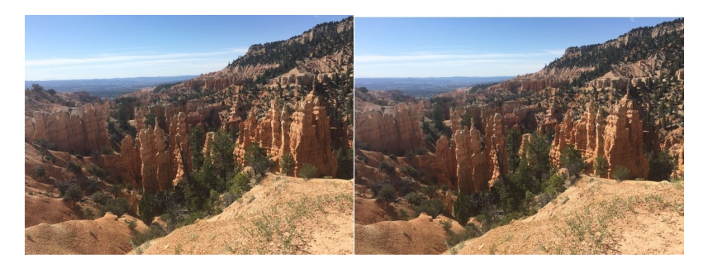
June 27, 2016: Bryce Canyon